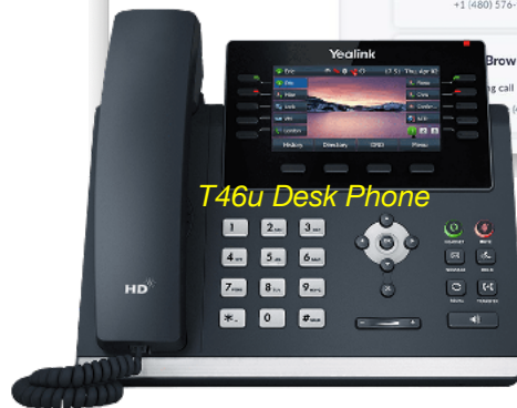
T46u Desk Phone

Nextiva's Desk Phones provide the traditional tools office staff need without overly complicating each task. The NextiveOne App further enhances the experience with integrated chat, meeting tools and voicemail transcriptions.